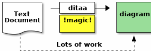
Figure: Image imported using ditaa